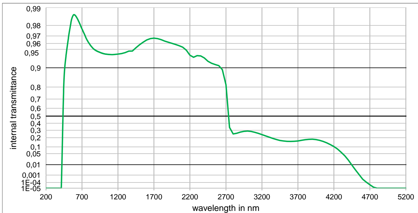
Internal transmittance \tau_i at reference thickness The internal transmittance values, tabulated and graphically represented, are reference values only