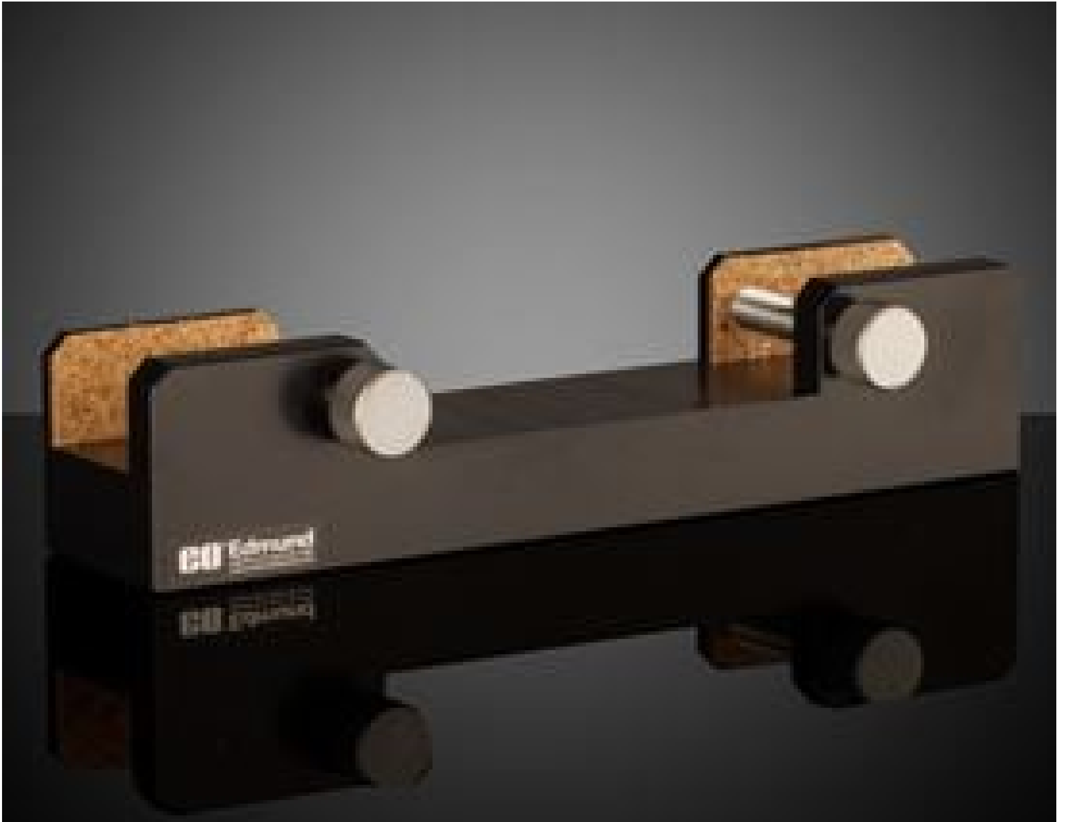
80mm Sq., Fixed Filter Holder